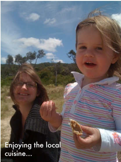
Enjoying the local cuisine...

We took the overnight ferry to Tasmania from Melbourne on